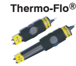
Switch Sensors FT10/GT10/LU10