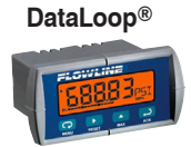
Solid Indicator L125-2