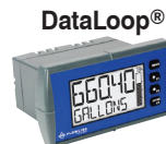
Level Indicator LI23/24