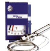
INTRINSICALLY SAFE CONTROLLERS