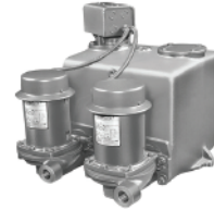
SPB1027 ELECTRIC COMPACT FOR HOT CONDENSATE