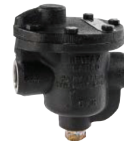
B1H INVERTED BUCKET STEAM TRAP