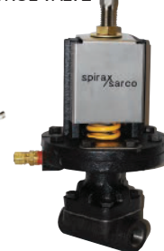
25 MP DIRECT ACTING VALVE