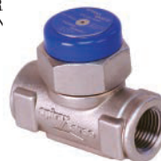
TD52 THERMO-DYNAMIC STEAM TRAP