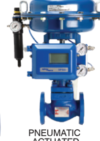
PNEUMATIC ACTUATED CONTROL VALVE