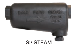
S2 STEAM SEPARATOR