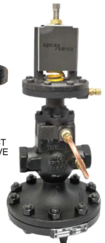
25 SERIES REGULATOR