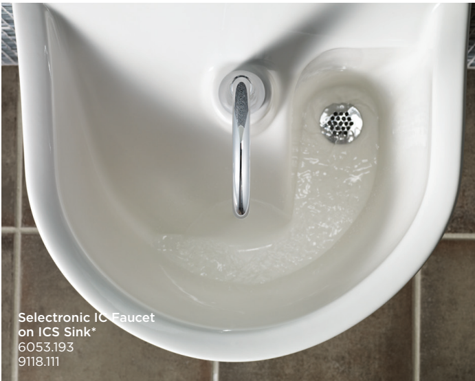
Selectronic IC Faucet on ICS Sink* 6053.193 9118.111