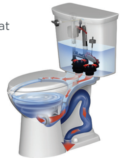
VorMax UHET 238AA.114