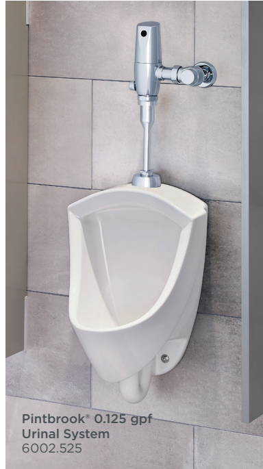
Pintbrook® 0.125 gpf Urinal System 6002.525