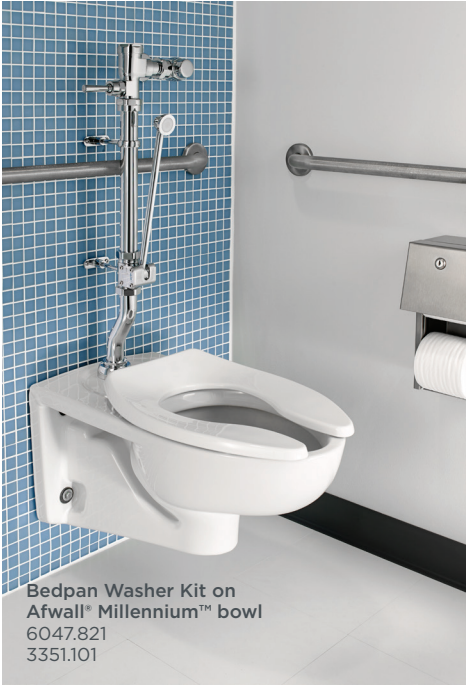
Bedpan Washer Kit on Afwall® Millennium™ bowl 6047.821 3351.101