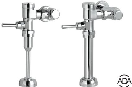
Manual Exposed Flush Valves 6045 Series (Urinal) 6047 Series (Toilet)