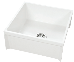
Fiat® Modesto™ Molded-Stone® Mop Service Basin msb2424.100