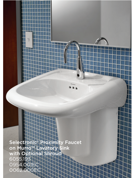
Selectronic® Proximity Faucet on Murro™ Lavatory Sink with Optional Shroud 6055.193 0954.001EC 0062.000EC