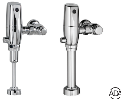
Selectronic Exposed Flush Valves, PWRX® 6064 Series (Urinal) 6066 Series (Toilet)