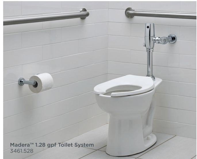
Madera™ 1.28 gpf Toilet System 3461.528