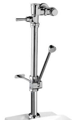
Bedpan Washer Kit for Manual Flush Valve 6047.800