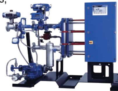
EASIHEAT 10-140 GPM DOMESTIC 40-280 GPM BUILDING HEAT