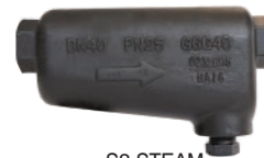
S2 STEAM SEPARATOR