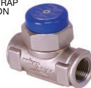
TD52 THERMO-DYNAMIC STEAM TRAP