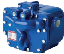
APT 14 STEAM PUMPTRAP