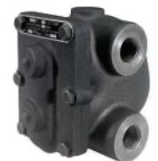
FT-15 FLOAT & THERMOSTATIC STEAM TRAP