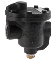
B1H INVERTED BUCKET STEAM TRAP