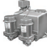
SPB1027 ELECTRIC COMPACT FOR HOT CONDENSATE