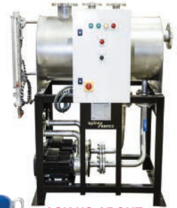
ASK US ABOUT SPIRAX SARCO FABRICATION SERVICES