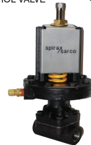
25 MP DIRECT ACTING VALVE