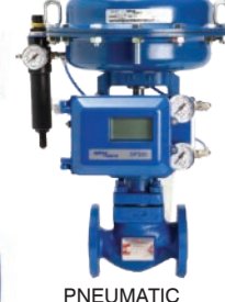
PNEUMATIC ACTUATED CONTROL VALVE