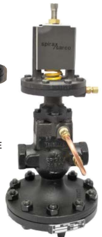
25 SERIES REGULATOR