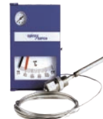
INTRINSICALLY SAFE CONTROLLERS