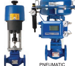
ELECTRIC ACTUATED CONTROL VALVE