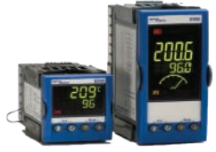
PNEUMATIC ACTUATED CONTROLLERS